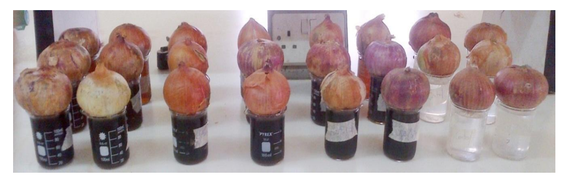
Fig. 2. Photograph of experimental layout