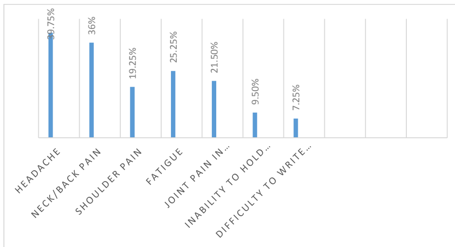
Fig. 2. Percentage of extraocular symptoms among cellphone adductors