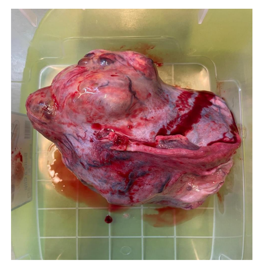
Fig. 3. Operative specimen of an immature teratoma from our patient

classification was initially proposed by Thurlbeck and Scully and modified in 1976 by Norris and O'Connor to better define therapeutic indications [1,2] (Table 1). Currently, this classification tends to be simplified into low and high grades [13]. Tumors with a better prognosis are grade 1 tumors, for which the five-year survival rate is estimated between 81 and 94% [7,14,15]. Grade 3 immature teratomas have a highly malignant potential and their rapid evolution, both locally and distally, results in higher rates of recurrence and mortality [7,14,15].