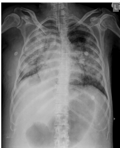
Figure 2. Portable Chest X-ray in the Patient a Few Hours After Balloon Valvuloplasty Which Shows Bilateral Diffuse Infiltration.

systolic blood pressure to 80 mm Hg and increased heart rate to 145/min. Her ICU course was further complicated by ventilator associated pneumothorax which was managed with chest tube insertion. Unfortunately despite all efforts, she died less than 3 days after being transferred to ICU due to shock state and severe oxygen desaturation.