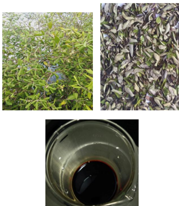
Fig. 1. Collection of Avicennia marina plant collection and preparation