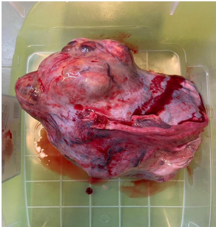
Fig. 3. Operative specimen of an immature teratoma from our patient

classification was initially proposed by Thurlbeck and Scully and modified in 1976 by Norris and O'Connor to better define therapeutic indications [1,2] (Table 1). Currently, this classification tends to be simplified into low and high grades [13]. Tumors with a better prognosis are grade 1 tumors, for which the five-year survival rate is estimated between 81 and 94% [7,14,15]. Grade 3 immature teratomas have a highly malignant potential and their rapid evolution, both locally and distally, results in higher rates of recurrence and mortality [7,14,15].