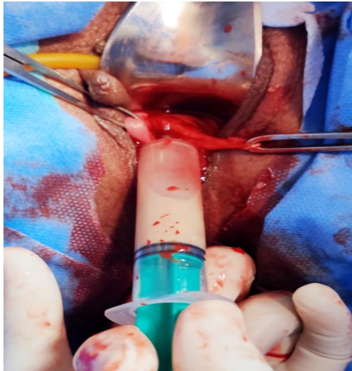
Fig. 3. Vaginal drainage of pus from right pararectal abscess