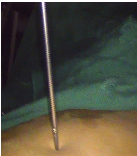
Fig. 1. Port closure needle

50 patients under went modified two port laparoscopic cholecystectomy. The median age of patients was 25 years and the range was 12 - 50 years. There were 28 females and 22 males in the study.