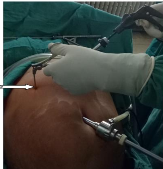
Fig. 4. Port position and port closure needle marked by arrow