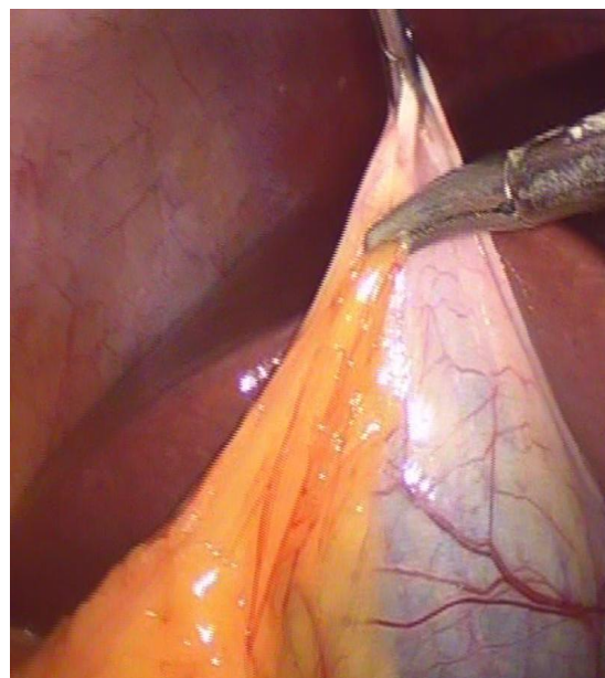
Fig. 2. Port closure needle to retract fundus