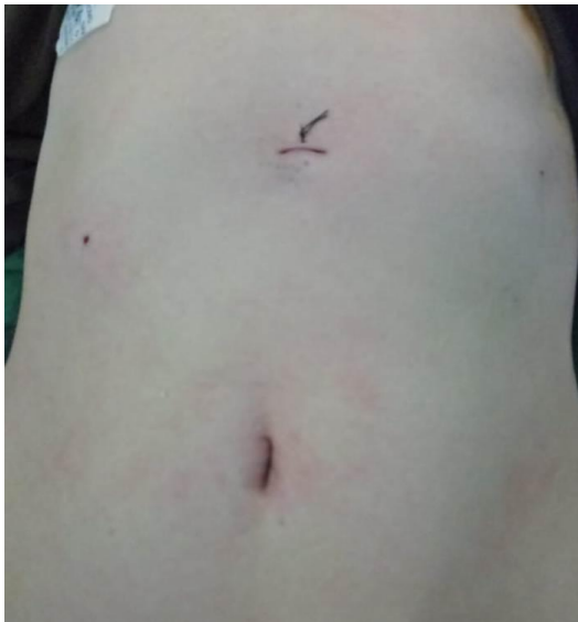
Fig. 5. Post operative scar and